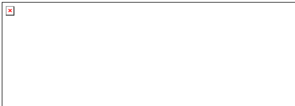
Figure 1: phpSyntaxTree is a web application available under GNU General Public License from sourceforge.net. One departure from convention in this parse tree is the use of Brown POS tags to identify parts of speech at terminal nodes. http://sourceforge.net/projects/phpsyntaxtree

A full parse of the above sentence from Winograd [8] shows that while prosodic structure is linear, syntactic dependencies create a multi-layer structure, traditionally represented as a parse tree: